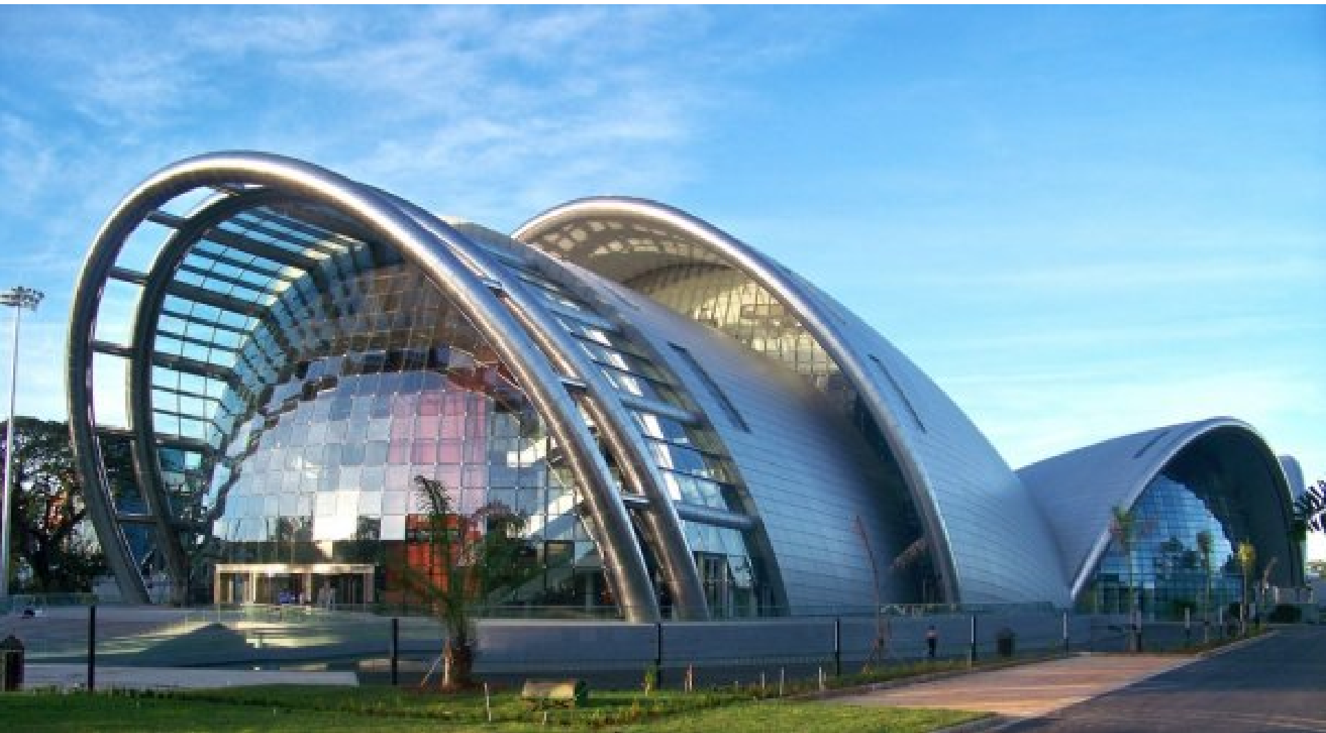
National Academy for the Performing Arts Queens Park Savannah Port of Spain